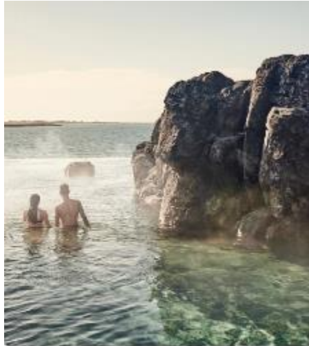
Sky Lagoon Entrance Pass With 7-Step Spa Ritual