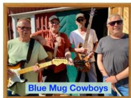
Blue Mug Cowboys Rock & Golf Band Playing CCR, ZZ Top, Rolling Stones, Tom Petty...